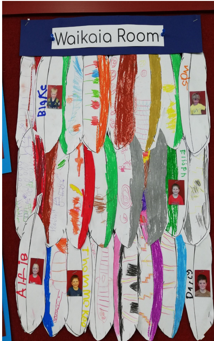
Our big book was the Lazy Duck, using feathers the children made some lazy ducks.